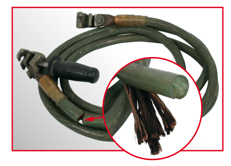
Faulty earthing and short-circuiting device, short-circuiting cable with advanced black colouration

Qualified electricians are familiar with these vital rules. But what about the safety and reliability of devices and equipment by which essential information is gained or work sequences are safeguarded? Any measure is just as safe as the safety equipment used.