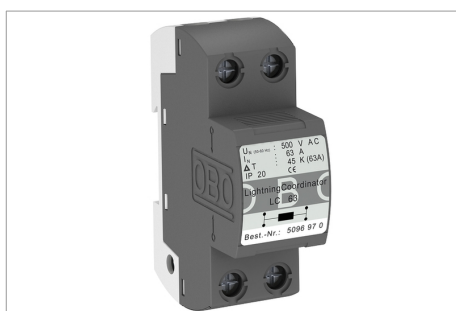
LC 63: Decoupling inductivity.